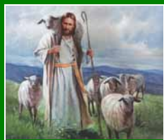
Let's take time this Lent to reflect on the Good Shepherd's love for us!