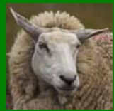
Mrs. Gadabout was a beautiful ewe sheep in good health.

This article is reprinted from the Lutheran Girl Pioneers publication "The Prairie Schooner News," March 2015 edition. "The Prairie Schooner News" the monthly newsletter for the girls in Lutheran Girl Pioneers.